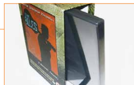
RIGID BOARD PACKAGING