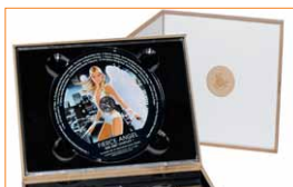
BAMBOO AND MDF BOXES AND PACKAGING