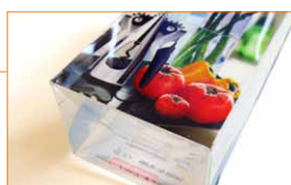
CLEAR PLASTIC PACKAGING