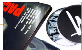
TINS (CD and DVD size)